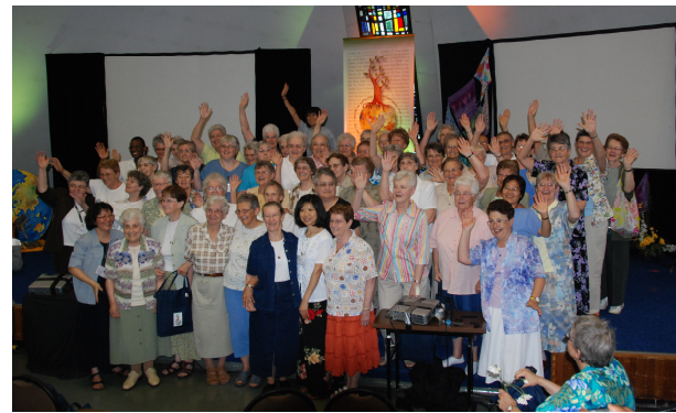
General council members